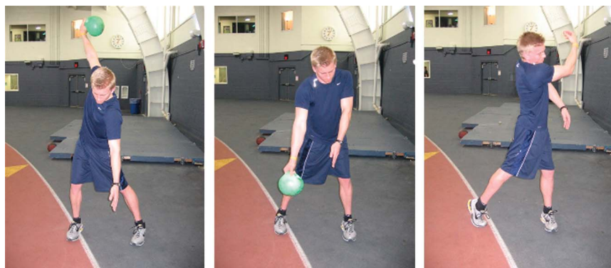
Figure 4. Static stance downward toss.

differs compared with a serve in direction of rotation, plane of movement, the countermovement (single plane versus circular), and the number of limbs involved. Furthermore, this same tennis player should work to develop a strong forehand swing with the body in a variety of positions (1). For this athlete, a variety of throws can be used to help the athlete better produce