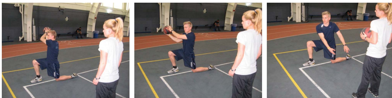
Figure 2. Wood chop throws.