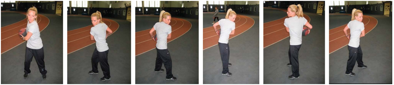
Figure 5. Power throws from a variety of stances.