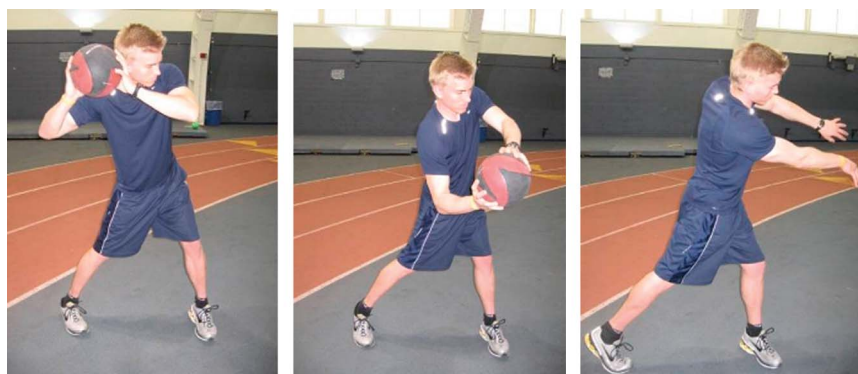
Figure 3. Medicine ball baseball throw.