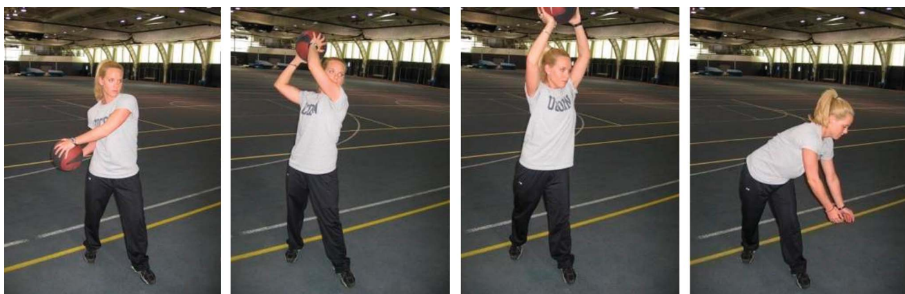
Figure 1. Overhead diagonal medicine ball throw.

With sports such as tennis, differences can be seen not only in comparison to other sports but also between different tasks within the sport itself (1,2). For example, 2-handed backhand volley