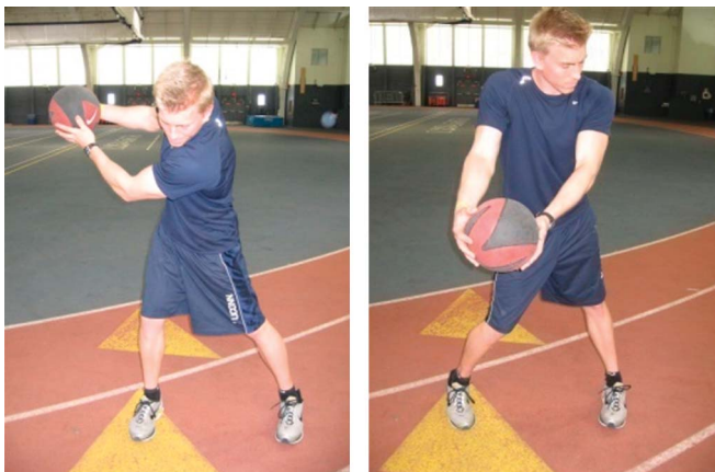
Figure 7. Lateral power throws.

the first several workouts to minimize the potential for muscle strains and pulls, especially in novel movements to the athletes. Medicine ball training is a supplemental component of a training program and should be integrated as part of a periodized progressive resistance training program to optimize