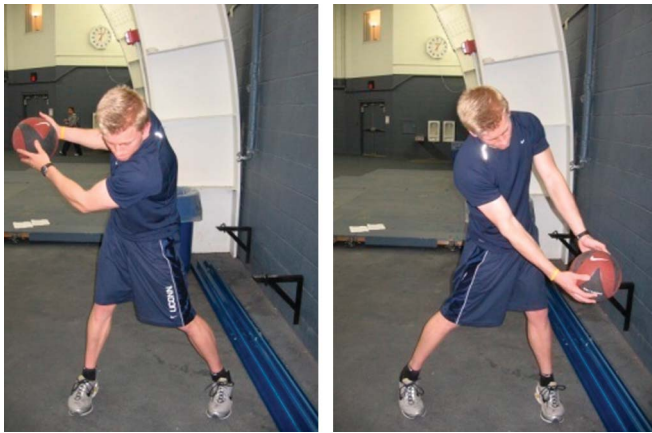
Figure 6. Rapid lateral medicine ball bounces.