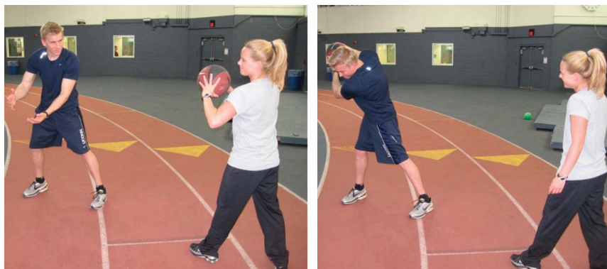
Figure 8. Lateral power throw starting from catch.